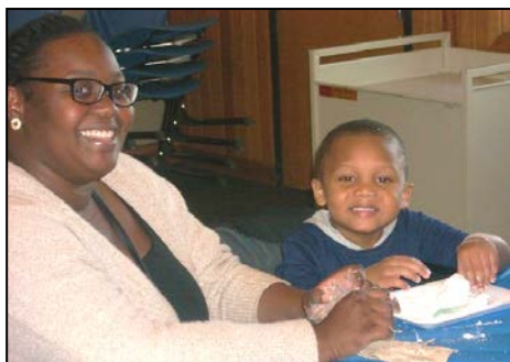
Families having fun together during Kids Create – Fake Snow Lab