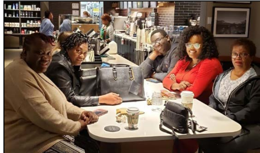
Inspire Me Book Club