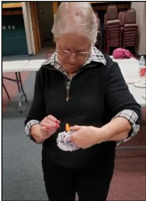
Crafts My Way