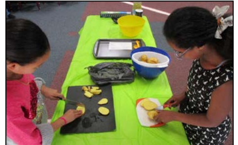
Teens Skills: Hamburgers & Fries