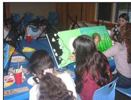
After School Hang: Painting with acrylics!