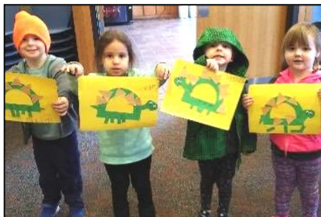
Story Time Fun!