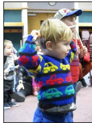
Musical Me: Musical Fairytales with the Fayetteville Symphony Orchestra